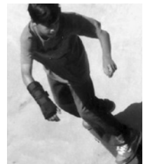
photo credits and information can be found in their respective chapters